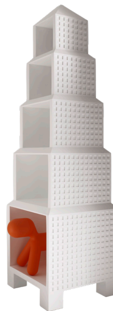
Matt colour White 1736 C