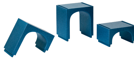
Colour Blue 1606 C