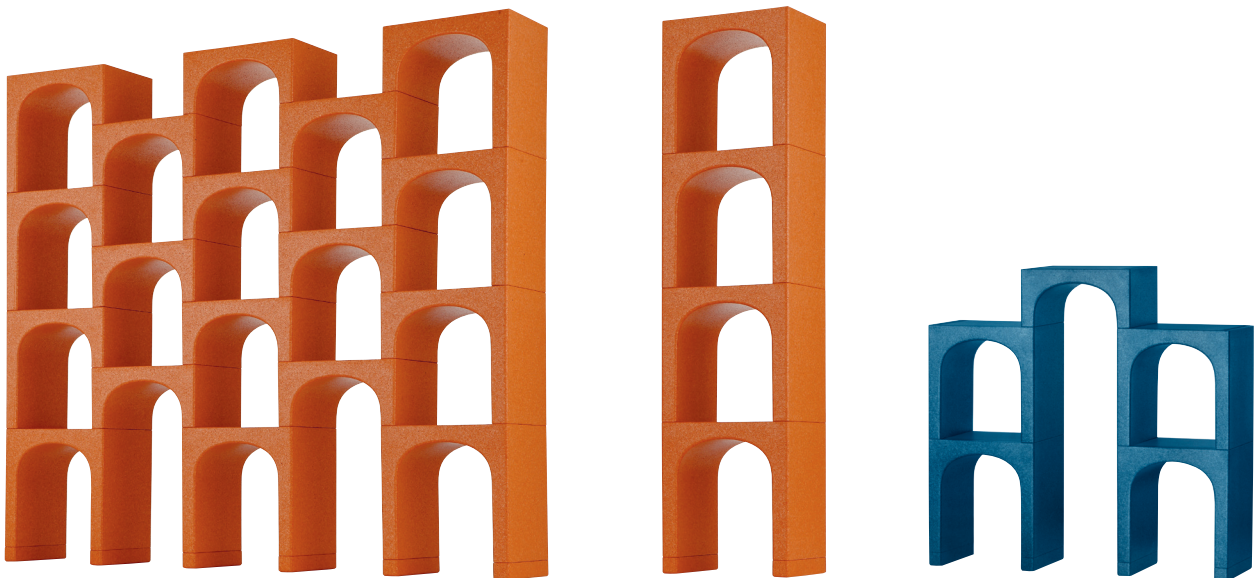
Examples of Composition