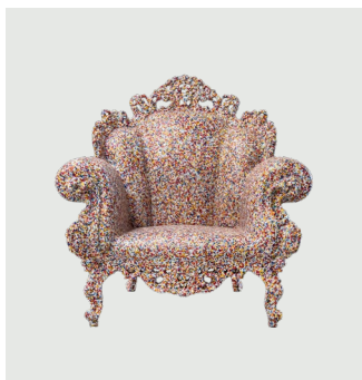
Multicolour w/ white background