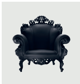
Black 1763 C