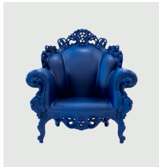
Blue 1192 C