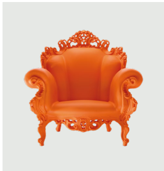
Orange 1087 C