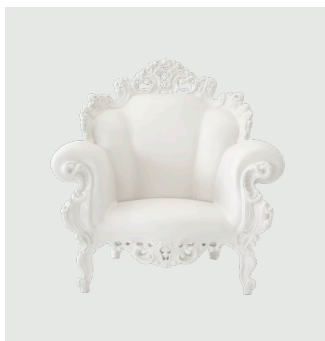
White 1735 C