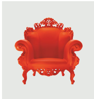
Red 1114 C