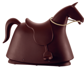
Matt colour Brown 1069 C