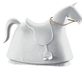
Matt colour White 1736 C