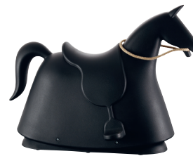
Matt colour Black 1768 C